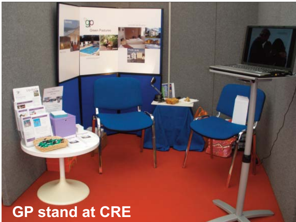
GP stand at CRE

and attend the AGM on the 4 July. Members will receive a 15% discount (provided they attend the AGM). If you would like to become a member, please ring us to apply for membership (£25 per annum). This will entitle you to the discount and to vote at the AGM. The AGM will start at 10.30 am on 4 July and finish with a light buffet lunch. We very much hope you will come, express your views and help shape the future of GP.